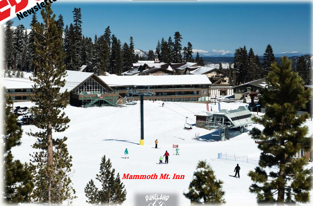
Mammoth Mt. Inn