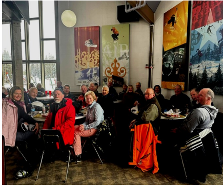
DSC. lunch w/some of our Newest Members