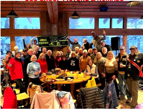
DSC GROUP PICTURE & NOMADS