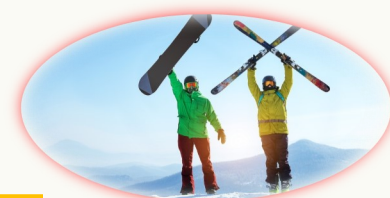
We Ski & Snowboard